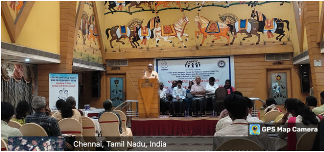
Chennai, Tamil Nadu, India