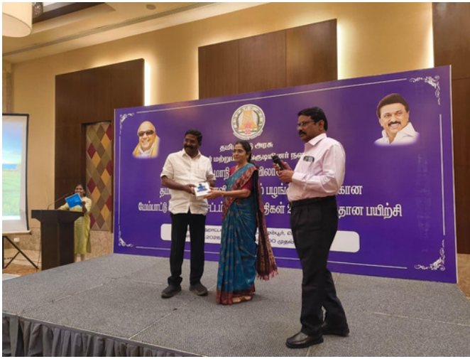
State-Level Training on SC/ST Development Action Plan Act