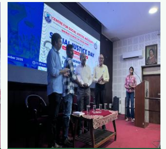
Chief Guest Address