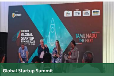
Global Startup Summit