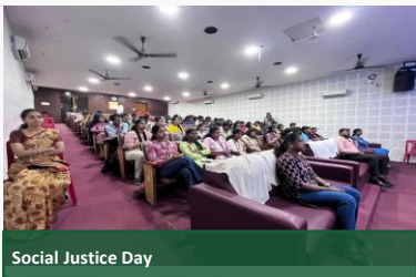
Social Justice Day