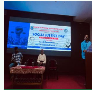
Social Justice Day Banner