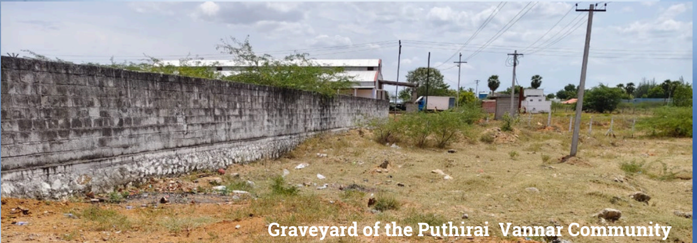
Graveyard of the Puthirai Vannar Community