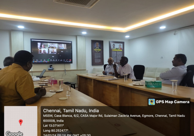
Chennai, Tamil Nadu, India MSW, Casa Blanca, 6/2, CASA Major Rd, Sulaiman Zackria Avenue, Egmore, Chennai, Tamil Nadu 600008, India Lat 13.071411° Long 80.252477° 24/01/24 05:08 PM GMT +05:30

CSJE submitted its Quarterly Report which consists of activities from the month of September to December.