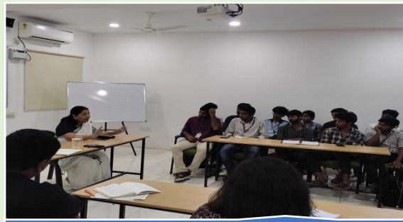
Seminar on Social Justice