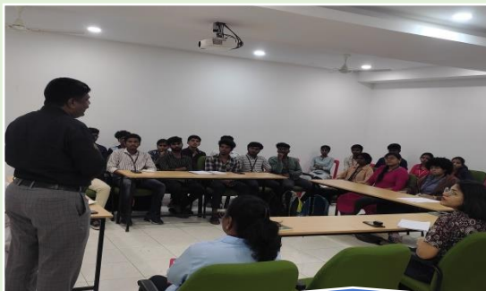
Seminar on Social Justice