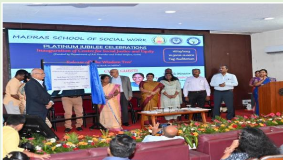
Inauguration of the Centre for Social Justice and Equity